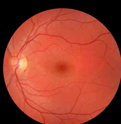
Image 2. NEW OCT-REVO 3D scan